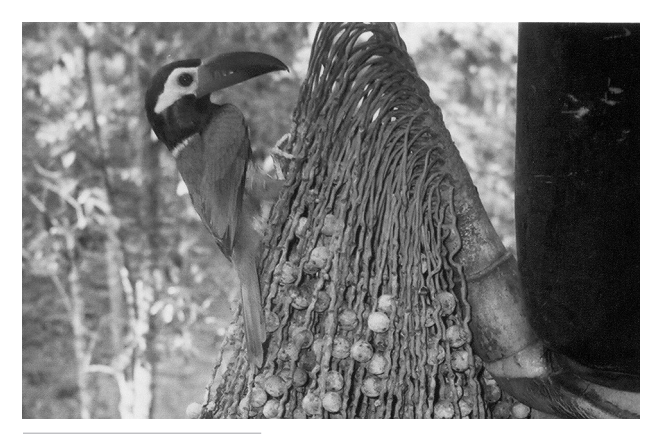
Figure 3 - Selenidera piperivora is an important fruit consumers and dispersal agent of Rosewood ( Aniba rosaeodora Ducke).

The RAPD fragments from samplings plants ranged in size from 0.3 to 2.0 kb; 55 of 71 were polymorphic (77.5%)